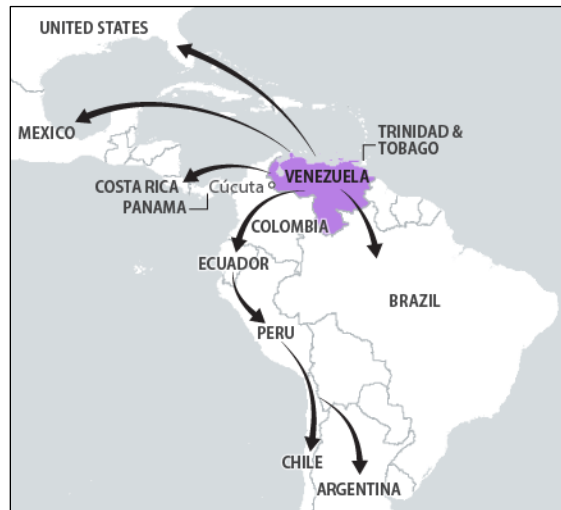
Figure 3. Venezuelan Migrants and Asylum Seekers: Flows to the Region and Beyond

Venezuela's exodus is an unprecedented displacement crisis for the Western Hemisphere, which has in place some of the highest protection standards in the world for displaced and vulnerable persons. Countries in the region are under pressure to examine their respective migration and asylum policies and to address, as a region, the legal status of Venezuelans who have fled their country. It remains to be seen how events unfolding inside Venezuela will continue to impact the ongoing humanitarian situation and response.