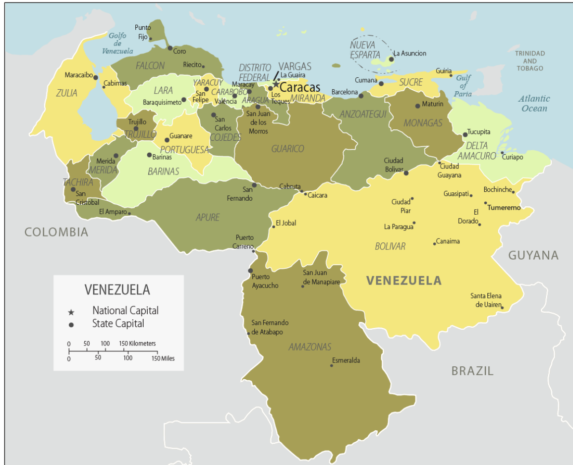
Figure I. Political Map of Venezuela