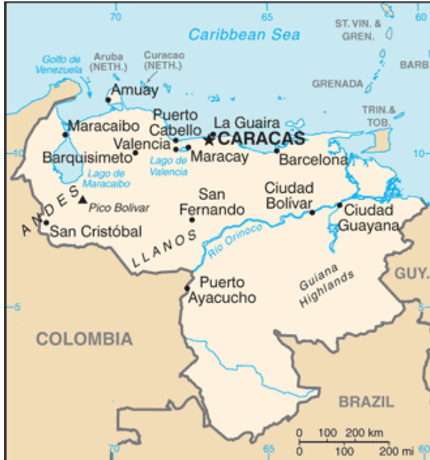
Figure 2: Venezuela Map