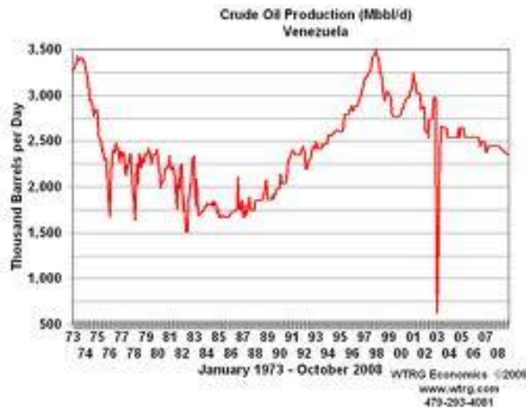
Figure 3: Venezuelan Oil Production

The chart depicts Venezuelan crude oil production. Note the dip in 2002-2003 during the general strike.